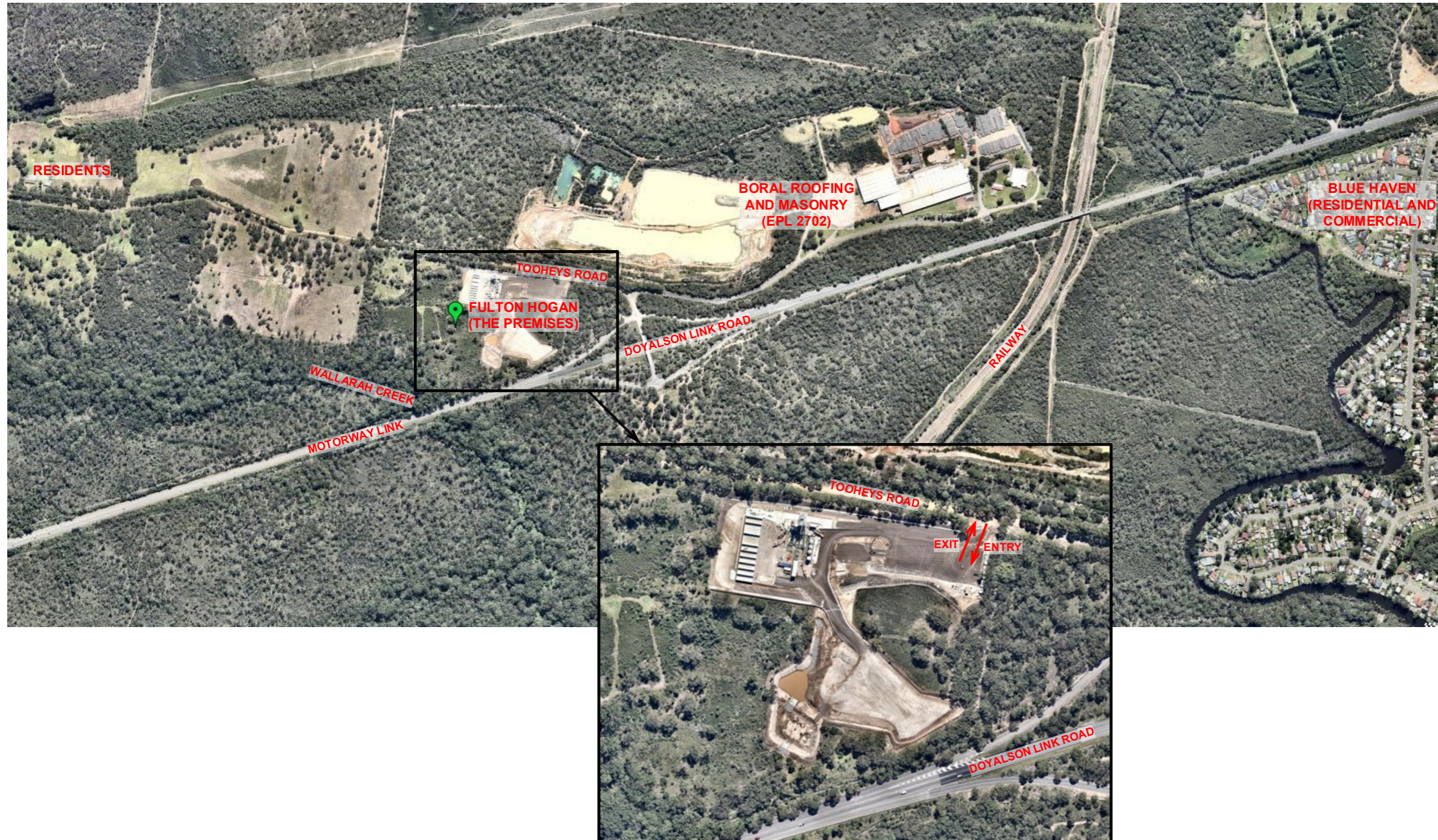
Figure 1 Location of the premises to which the licence relates and surrounding area likely to be affected by a pollution incident